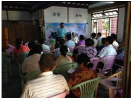
The seminar in the highlands

+ Another woman shared that when they were first married, some words were spoken over them in the ceremony. But this was the first time, after 20-something years of marriage, that they had made vows to each other "from the heart."