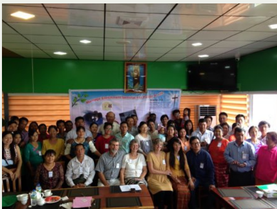
The first seminar group - in a large city

The trip was grueling - 40 hours of travel each way encompassing 5 different flights. But it was so worth it!! We did several marriage seminars for pastors and their wives while in the country, along with some ministry at a local church. At the end of each seminar, we prayed prophetically for every couple, releasing more of God and speaking things into their lives and marriages that we felt the Lord wanted to seed or bring to life.