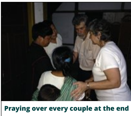
Praying over every couple at the end

+ A wife married for 47 years glowingly told us in private that she feels like their marriage has been renewed and "filled up" once again. She made us promise to come to their home when we return.