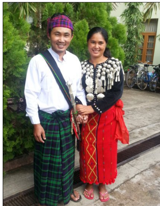
This precious couple wanted us to see them in their traditional dress