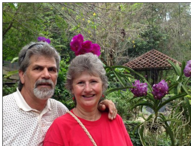
Taking a break from ministry at some botanical gardens - those are orchids behind us!

P.S. Apologies for such a long newsletter this time!!