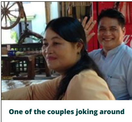
One of the couples joking around

+ One couple rode 7 HOURS on a small MOTORBIKE to come to one of the marriage seminars. Their hunger and willingness to make such a sacrifice so touched our hearts. They were not young, either!!