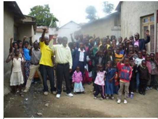
Tanzanian brothers and sisters full of love and joy!

conferences in four different areas of the region of Mbeya (southwest TZ). We will, of course, be ministering in some outdoor meetings and