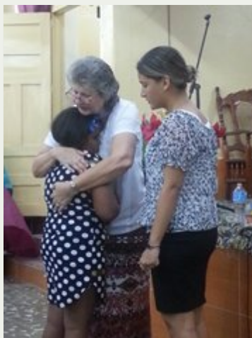
Ministering in one of the big city churches

But ALSO, many, many precious people were touched by the power of God, saved, delivered, healed and encouraged! The congregations of something like 10 churches were touched, from the mega to the house church, all overflowing with the