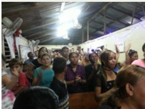
At this town (missed the name) there were probably 100 people crammed inside and another 150 outside!