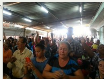
The crowd at the church in the town of Jamaica

unsaved from the surrounding communities. One of the most poignant healings concerned a lady deaf and