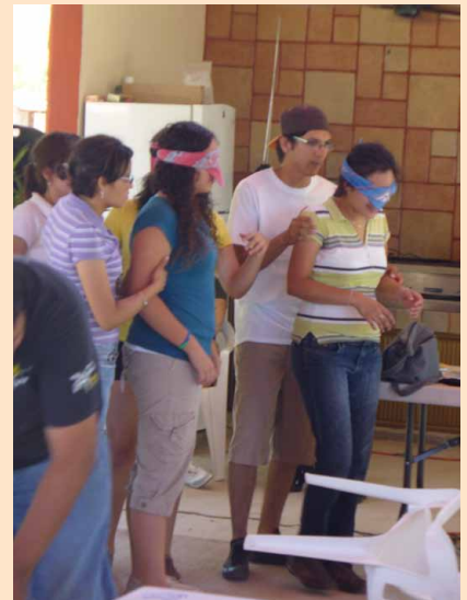
Team Building at Arts Workshop