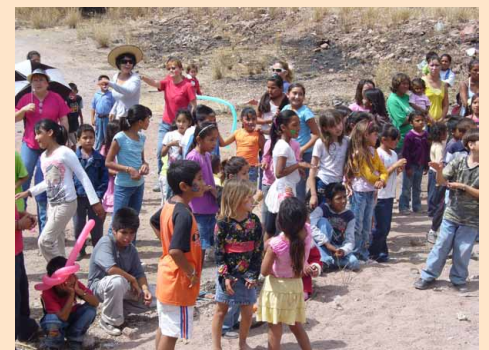
Children from Colonia Fatima